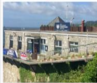
Single Box Ad