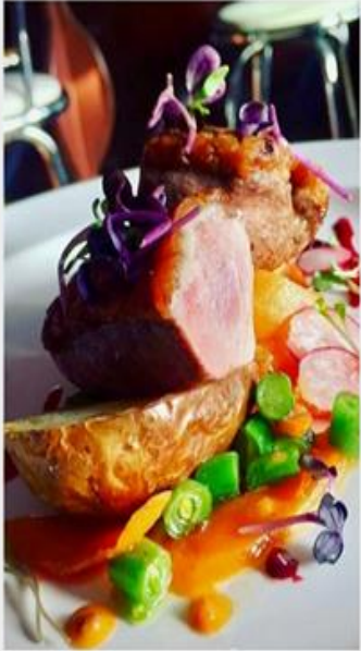
Sky Scaper Ad